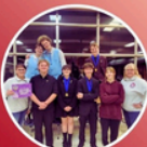
Speech & Debate National Qualifying Team