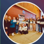
National History Day National Qualifying Team

Join us and enjoy a game night in a family-friendly atmosphere while supporting Bigfork High School's nationally-bound NHD to DC and Speech & Debate teams.